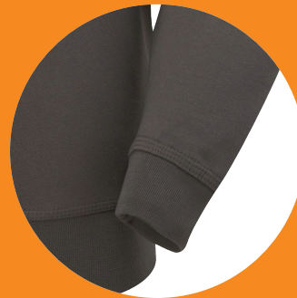
Elasticated cuffs and waistband