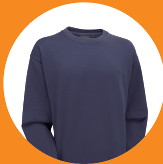
High quality premium weight