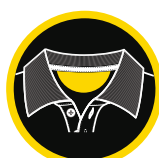
HALF MOON YOKE