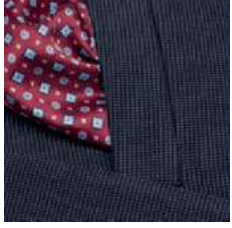
A. Navy Pin Dot