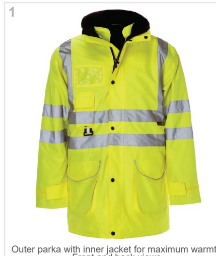
Outer parka with inner jacket for maximum warmth Front and back views