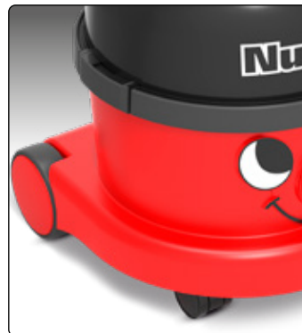
Heavy-duty Tough Bumper