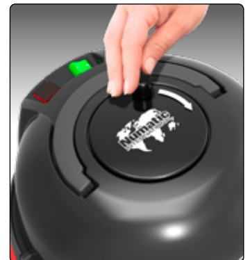
Trouble-free Cable Rewind